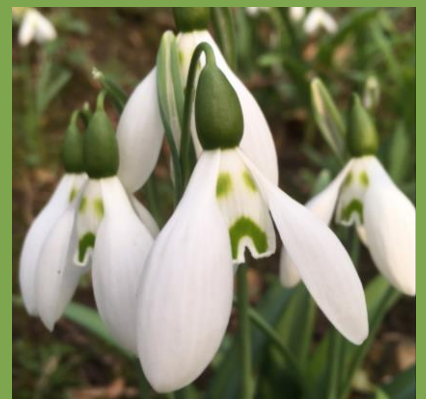
Galanthus elwesii 'Grumpy'