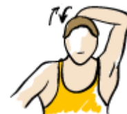
neck (front & back)