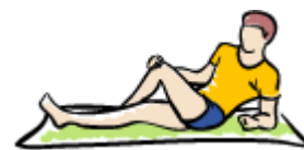
sitting hip stretch