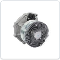
Part No. BP113-1199 ENGINE COOLANT WATER PUMP WITH ELECTROMAGNETIC CLUTCH