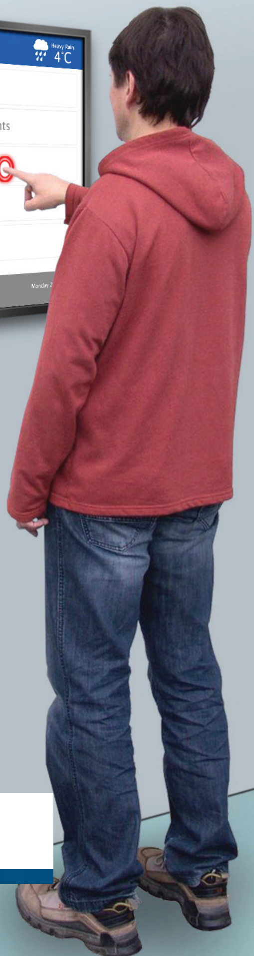
50" Wall Mounted Infrared Touch Screen with Dual OS