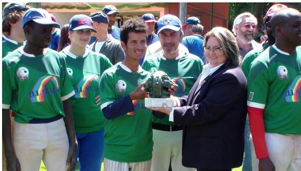
7 th Mole Cup (2017) – Award to the winning team of the tournament, the All Stars.

In the 7th edition, an All Star team made up of the best foreigner players in the Italian championship played in the event played in Parma under the sponsorship of the Parma Provincial Lions Clubs.