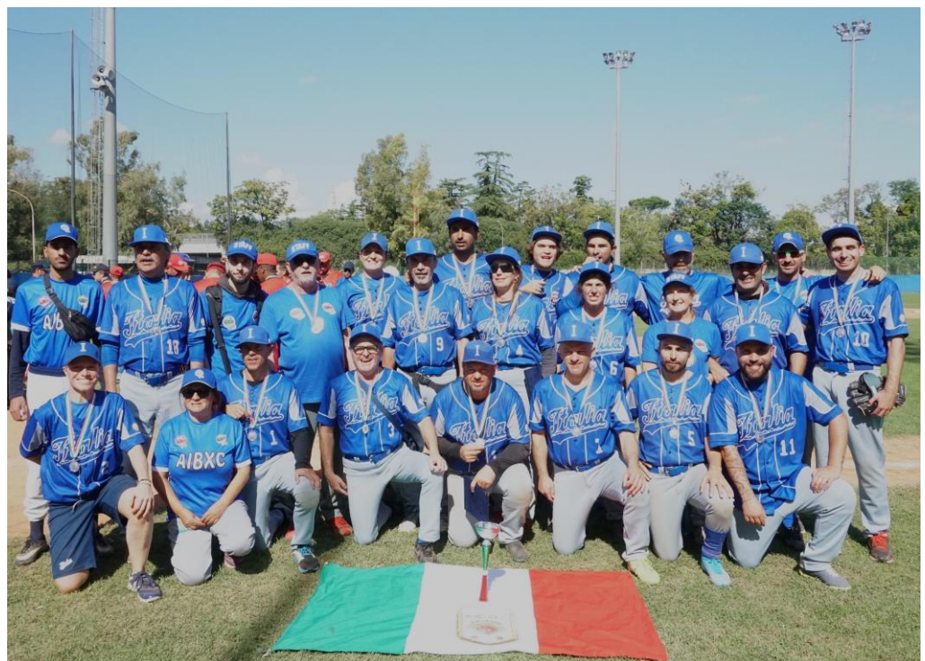
9 th Mole Cup (2019) – The Italian National Team that won the tournament.

The 9th edition played in Rome last year saw Cuba, the United Kingdom and the United States team from New York City play the tournament for the first time in history. Also for the first time, there was a night demonstration game between the teams from Cuba and Italy. This edition was very special as it also marked the celebration of the 25th anniversary of the first game of baseball for the blind in 1994.