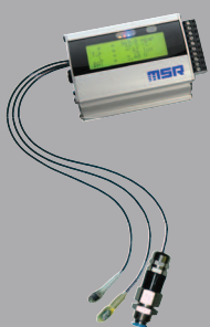
MSR255 with ext. sensors