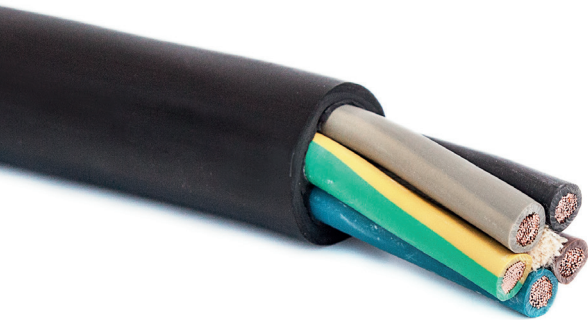
H07RN-F 450V/ 750V

Flexible rubber cable for movable use indoors and outdoors.