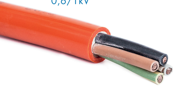
H07BQ-F 450/750V and 0,6/1kV

Flexible cable for movable use. H07BQ-F has a polyurethane outer sheath which makes the cable strong against mechanical stress and chemical environments. Suitable for use as temporary power supply at building sites and also installations along the floating docks.