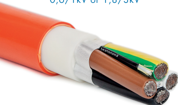
AQUALine FISHFARM HYBRID 0,6/1kV or 1,8/3kV

Flexible hybrid cable specially designed for the fish farming industry for power supply applications from land to an islet or island.