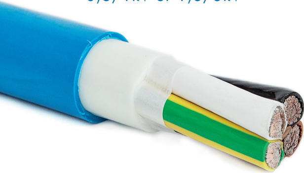
AQUALine FISHFARM 0,6/1kV or 1,8/3kV

Flexible cable specially designed for the fish farming industry for power supply applications from land to an islet or island.