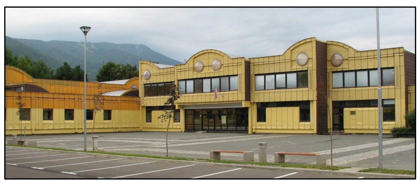
Primary school Tabor I Maribor

Primary school Tabor I Maribor, Municipality of Maribor was successful using Cohesion funds in the amount of 568.360,75 EUR.