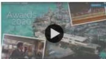
2020 SMART4SEA Awards - Highlights