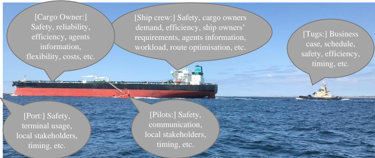
Figure 1: Tanker leaving the port of Brofjorden assisted by pilots and a tug having various interests and drivers, involving various stakeholders that could benefit from coherent information sharing and automated processes