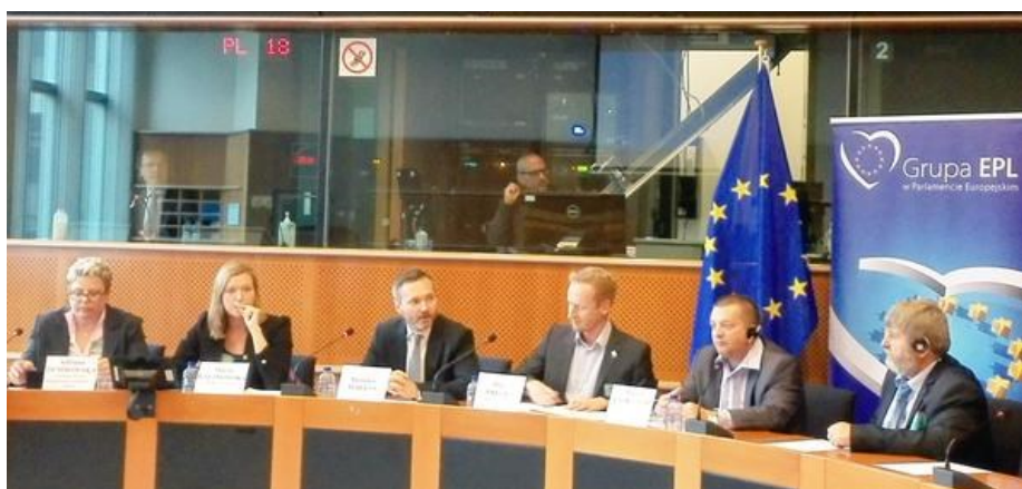
MEP Jarosław Wałęsa, WWF Poland and fishermen in the European Parliament

WFO is pleased with the fishermen testimonials, demonstrating that a growing number of fishermen around Europe are dedicated to the fight against marine litter. Therefore WFO will strengthen the cooperation with WWF Poland and the Polish fishing communities.