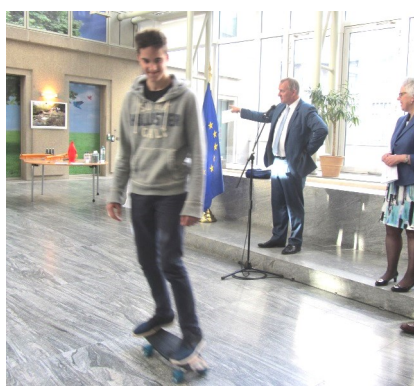
Riding the Bureo skateboard made from recycled fishnets