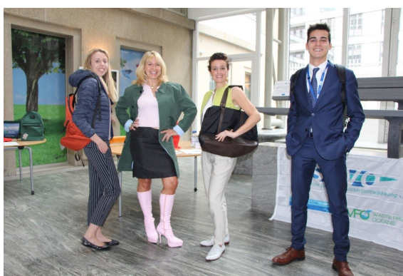
Fashion show of Ecoalf items made from recycled plastic bottles and fishing gear

WFO also be gifted DG MARE with benches made from recycled marine litter, which have been placed in DG MARE's green courtyard, which the faculty was able to enjoy during Brussels' exceptionally warm summer.