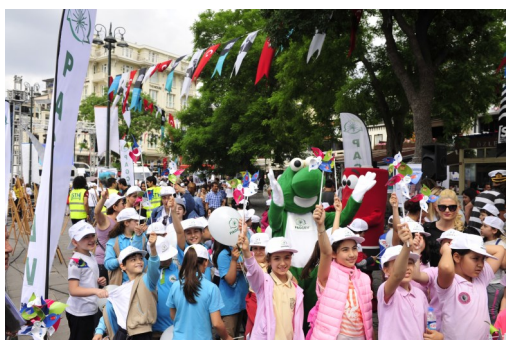
The Sea and Environment Festival in Istanbul

WFO Turkey has been working on drawing a map of marine litter hotspots in the Black Sea and the Sea of Marmara with the leading research institution TÜBİTAK (The Scientific and Technological Research Council of Turkey) . A first survey mission took place last April, when WFO 's special net was installed on the TÜBİTAK MAM Survey Vessel off the coast of Kınalıada in Istanbul. Another survey is planned to take place in the Gulf of İzmit, while fishermen cooperatives in Istanbul will assist in determining hotspots. TÜBİTAK will also provide technical support to WFO on improving the net.