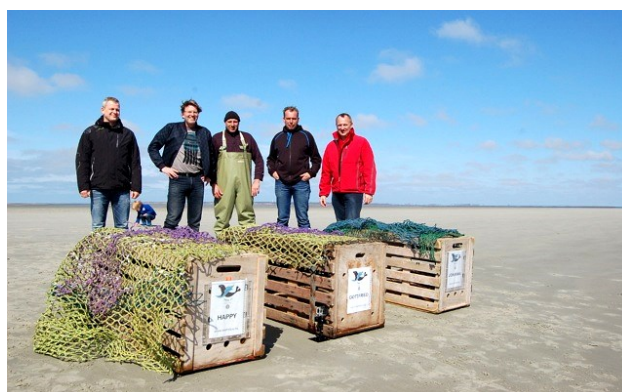
Releasing seals back into the ocean after their recovery at the Pieterburen European Happy Seal Centre