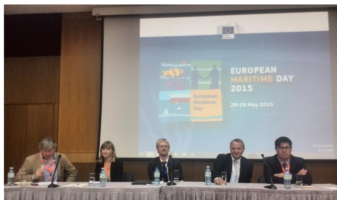
Workshop 'Port Reception Facilities to Tackle Marine Litter' at European Maritime Day 2015

WFO is keen to hold another exhibition booth and workshop again in 2016 and to tackle the next challenge with the help of all invested stakeholders.