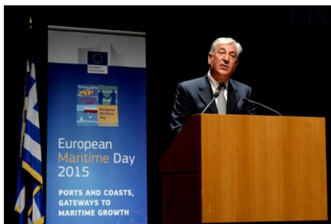
EU Commissioner for Environment, Maritime Affairs and Fisheries Karmenu Vella in Athens, Greece