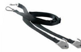
1.05.116: GUTTER STRAP