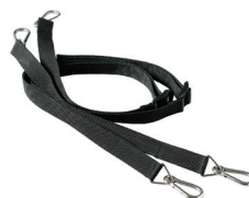
1.05.112: WET DECK STRAP