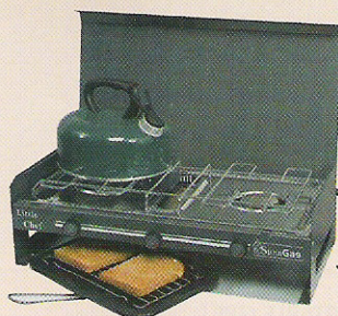
LITTLE CHEF DOUBLE BURNER & GRILL