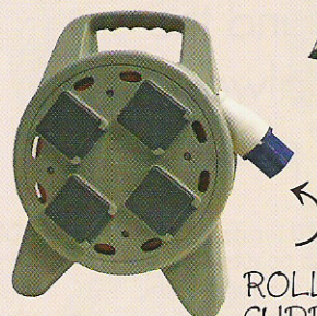
ROLLER MOBILE SUPPLY UNIT