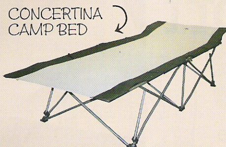
CONCERTINA CAMP BED