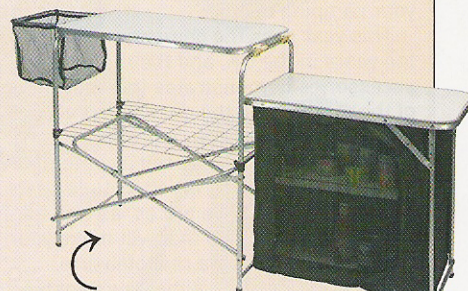
SUPERLITE ALUMINIUM KITCHEN