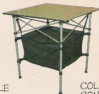
ROLL SLAT TABLE