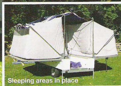
Sleeping areas in place