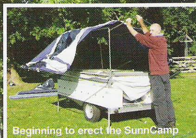
Beginning to erect the SunnCamp