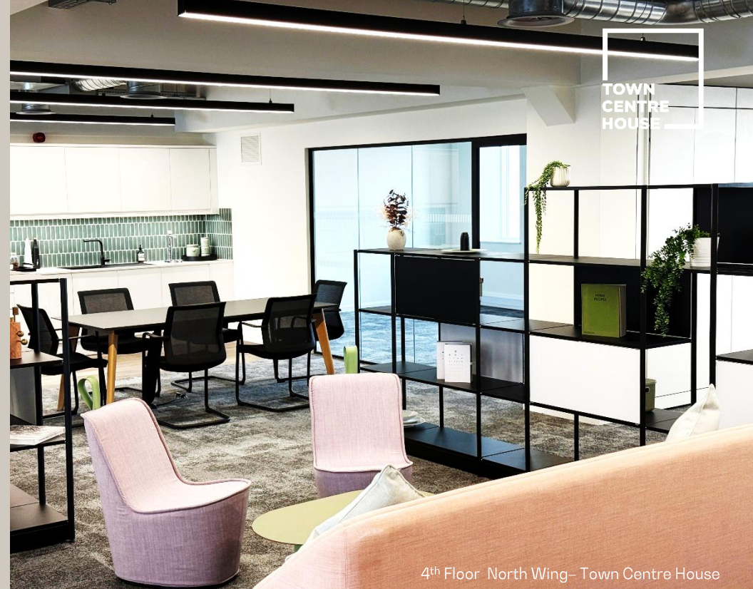
4 th Floor North Wing – Town Centre House