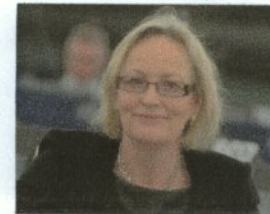
Julie Girling MEP For the South West of England and Gibraltar