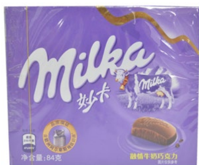
FIGURE 1: MONDELEZ CHINA, MILKA MELT MILK CHOCOLATE, 2016

Market shares of more premium manufacturers, including Lindt, Pladis Foods and Ferrero, have increased in 2016 as consumers seek out premium options, particularly for gifting. The growth of these manufacturers highlights the opportunities that remain.