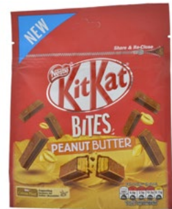
Nestlé, KitKat Peanut Butter Mini Crispy Wafer Fingers