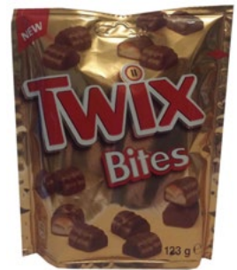
Mars Inc, Twix, Milk Chocolate Coated Cookies and Caramel