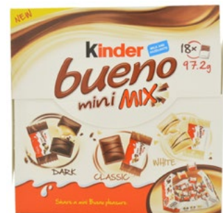
Ferrero, Kinder Bueno Mini Mix Mini Chocolate Bites