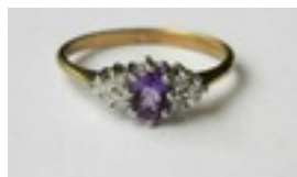
Lot: 30 AMETHYST AND DIAMOND CLUSTER RING on nine carat gold shank, ring size L-M Estimate: £80.00 - £100.00