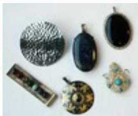
Lot: 28 SIX LARGE SILVER PENDANTS including stone and turquoise set examples (6) Estimate: £40.00 - £60.00