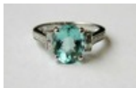
Lot: 35 AQUAMARINE AND DIAMOND DRESS RING the oval cut aquamarine approximately 2.57cts flanked by diamond set shoulders, on eighteen carat white gold shank, ring size J-K Estimate: £650.00 - £700.00