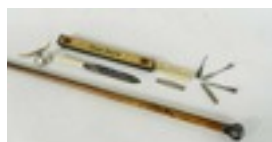
Lot: 138 COLLECTION OF SILVER ITEMS comprising a 'Teacher's Whisky 1830-1930' pocket knife, Sheffield 1930 with box; small George V desk ornament with mother of pearl horns, Chester 1914; period silver mounted cake knife, Sheffield 1922 with box; Sterling silver and enamel 'Winnipeg' souvenir pen knife; bookmark with thistle finial; Edwardian button hook; period silver topped walking cane, London 1905; and part of a George III teaspoon, Edinburgh 1814 (8) Estimate: £60.00 - £80.00