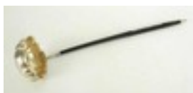
Lot: 132 SILVER TODDY LADLE the shaped bowl with hallmarks for Sheffield 1971, the wooden handle with twist detail Estimate: £100.00 - £120.00