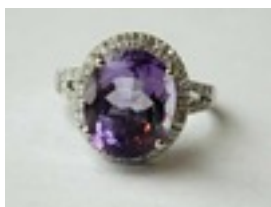
Lot: 49 AMETHYST AND DIAMOND CLUSTER DRESS RING in fourteen carat white gold, the central oval cut amethyst approximately 5.8cts in diamond surround and with further diamonds to the split shoulders, ring size M Estimate: £450.00 - £500.00