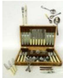
Lot: 155 CANTEEN OF CUTLERY for six place settings, a cased set of six tea knives, a cased set of six fish knives and forks, a boxed cake knife, six boxed tea knives and other cutlery and flatware Estimate: £30.00 - £40.00