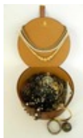
Lot: 31 ASSORTMENT OF COSTUME JEWELLERY including various beaded necklaces, earrings, ladies wristwatch, bracelets, etc Estimate: £30.00 - £40.00