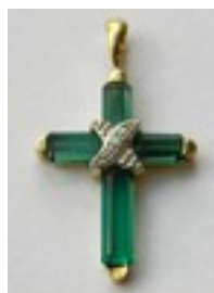
Lot: 62 DIAMOND AND GREEN GLASS CROSS PENDANT set in ten carat gold, 2.8cm x 1.6cm Estimate: £30.00 - £40.00