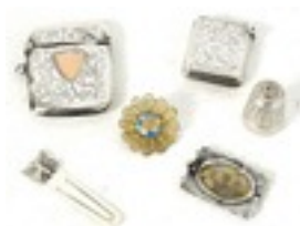
Lot: 133 COLLECTION OF SILVER ITEMS comprising George V silver vesta case with engraved scroll decoration; Edward VI silver vesta case section (hinged cover lacking); a silver thimble; a silver bookmark with butterfly finial; a silver mizpah brooch; and another filigree design brooch (6) Estimate: £50.00 - £60.00