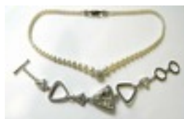
Lot: 67 SWAROVSKI CRYSTAL BRACELET with varying triangular links; and a Swarovski necklace, the graduated pearl necklace with central Swarovski crystal set ball and further crystals to the clasp (2) Estimate: £30.00 - £40.00