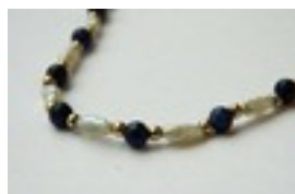
Lot: 33 RIVER PEARL AND LAPIS LAZULI NECKLACE with eighteen carat gold clasp and spacers, approximately 39cm long Estimate: £80.00 - £100.00