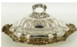
Lot: 153 SILVER PLATED LIDDED SERVING DISH of shaped outline with shell motif handles, the lid and handle decorated with scrolls, 39.5cm wide Estimate: £40.00 - £50.00