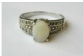
Lot: 26 OPAL AND DIAMOND DRESS RING the central oval cabochon opal flanked by diamond set shoulders, on unmarked white gold shank, ring size N-O Estimate: £70.00 - £90.00