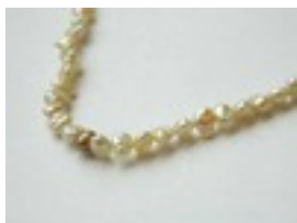
Lot: 29 RIVER PEARL NECKLACE with nine carat gold clasp, approximately 41.5cm long Estimate: £40.00 - £60.00