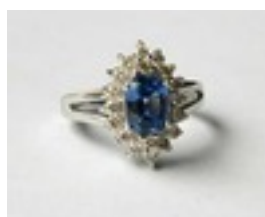
Lot: 57 ATTRACTIVE CEYLON SAPPHIRE AND DIAMOND CLUSTER RING the central sapphire approximately 1.5cts in diamond surround totalling approximately 0.53cts, on eighteen carat white gold shank with split shoulders, ring size M Estimate: £1,100.00 - £1,200.00