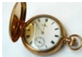
Lot: 47 WALTHAM GOLD PLATED POCKET WATCH with top winder, black Roman numerals and subsidiary dial on white enamel Estimate: £30.00 - £40.00