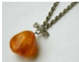
Lot: 34 AMBER PENDANT on fancy link twist chain, the large amber piece weighing approximately 14.8 grams Estimate: £40.00 - £60.00