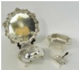
Lot: 150 SILVER PLATED SALVER of shaped outline with shell motifs, on three scroll supports; a small lidded dish with turned wooden handle on four pad feet; a lidded serving dish of shaped outline with two sections on lion paw feet; and a twin handled square serving dish with canted corners and beaded rim on four supports Estimate: £60.00 - £80.00