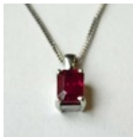
Lot: 32 EMERALD CUT RUBY PENDANT the ruby approximately 1ct in eighteen carat white gold and on eighteen carat white gold chain Estimate: £650.00 - £700.00