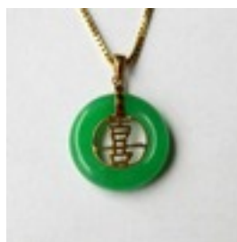
Lot: 55 JADE AND NINE CARAT GOLD PENDANT the circular jade piece with gold Chinese character to the centre, on nine carat gold chain Estimate: £80.00 - £120.00