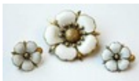
Lot: 38 PAIR OF PETER HERTZ SILVER GILT AND ENAMEL EARRINGS with similar design brooch, all in the form of flower heads with white enamel petals (3) Estimate: £40.00 - £60.00