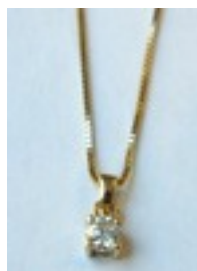
Lot: 60 DIAMOND SOLITAIRE PENDANT the round brilliant cut diamond approximately 0.25cts, in eighteen carat gold and with eighteen carat gold chain Estimate: £420.00 - £480.00