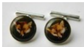
Lot: 59 PAIR OF SILVER AND ENAMEL CUFFLINKS the circular enamel panels depicting fox heads on a green ground, in box Estimate: £40.00 - £50.00