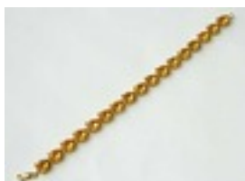
Lot: 25 CITRINE LINE BRACELET the pear cut citrines set in eighteen carat gold Estimate: £100.00 - £150.00