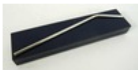
Lot: 129 SILVER DRINKING STRAW engraved 'thus', London and 925 marks, 21.9cm long Estimate: £25.00 - £30.00