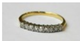
Lot: 65 DIAMOND NINE STONE DRESS RING set in unmarked gold, ring size N Estimate: £40.00 - £60.00