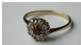
Lot: 68 RED AND WHITE GEM SET CLUSTER RING on nine carat gold shank, ring size N-O Estimate: £35.00 - £45.00