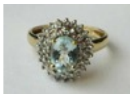
Lot: 56 AQUAMARINE AND DIAMOND CLUSTER RING the central oval cut aquamarine approximately 1.1cts in double diamond surround, on nine carat gold shank, ring size M-N Estimate: £80.00 - £120.00