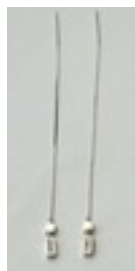
Lot: 44 PAIR OF DIAMOND SET EIGHTEEN CARAT WHITE GOLD DROP EARRINGS the diamond set sections suspended from white gold chains Estimate: £90.00 - £110.00