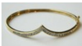
Lot: 27 CZ SET NINE CARAT GOLD BANGLE the channel set CZ stones in wishbone setting Estimate: £130.00 - £150.00