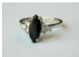
Lot: 45 SAPPHIRE AND DIAMOND RING the central marquise cut sapphire approximately 1.4cts flanked by three diamonds to each side, on eighteen carat white gold shank, ring size L-M Estimate: £300.00 - £350.00