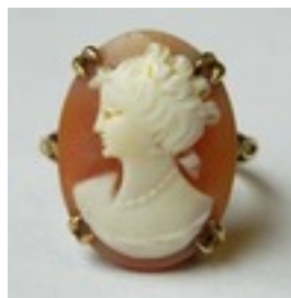
Lot: 53 CAMEO DRESS RING depicting a female profile, set in highly decorative nine carat gold mount, ring size J-K Estimate: £50.00 - £70.00