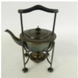
Lot: 152 SILVER PLATED SPIRIT KETTLE ON STAND having an ebonised shaped handle above a similar finial to the lid, the stand with removable burner Estimate: £20.00 - £30.00