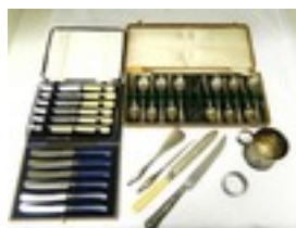
Lot: 136 VICTORIAN CASED SILVER BUTTONHOOK AND SHOEHORN marked for Chester and Birmingham 1863; two cake knives, one with a silver handle Sheffield 1966, the other with a silver collar Sheffield 1923; together with a quantity of silver plate to include a christening mug and napkin ring, six cased tea knives with ivory handles, six cased tea knives with blue stained handles and a cased set of twelve tea spoons and a pair of sugar tongs Estimate: £50.00 - £70.00