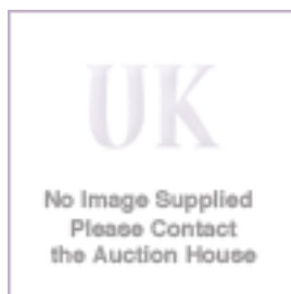
Lot: 66 SPARE LOT