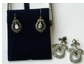
Lot: 63 TWO PAIRS OF MARCASITE AND GEM SET DROP EARRINGS both in silver Estimate: £25.00 - £35.00