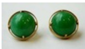
Lot: 51 PAIR OF CIRCULAR JADE EARRINGS in unmarked gold mounts Estimate: £200.00 - £250.00