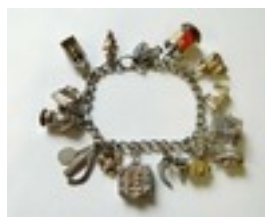
Lot: 54 SILVER CHARM BRACELET set with various articulated and other charms, including windmill, cash register, cat, horseshoe, etc. Estimate: £60.00 - £80.00