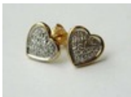
Lot: 48 PAIR OF DIAMOND CLUSTER STUD EARRINGS the heart shaped earrings in nine carat gold Estimate: £100.00 - £120.00