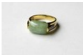
Lot: 41 JADE AND DIAMOND DRESS RING the central jade stone flanked by diamond set shoulders, on nine carat gold shank, ring size Q-R Estimate: £100.00 - £150.00