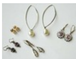
Lot: 58 FIVE VARIOUS PAIRS OF EARRINGS including a pair of gem set nine carat gold studs and four pairs of gem set and other silver drop earrings Estimate: £40.00 - £60.00