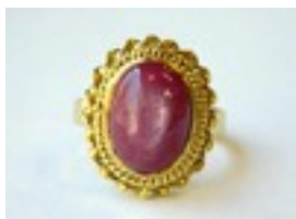
Lot: 50 NATURAL STAR RUBY DRESS RING the cabochon ruby approximately 8.35cts in gold rope twist design surround, in eighteen carat gold, ring size P Estimate: £380.00 - £420.00