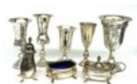
Lot: 134 COLLECTION OF VICTORIAN AND LATER SILVER and a plated condiment set, the small chalice with embossed menorah decoration and indistinct marks, 10cm high; the other four of varying designs and heights; the