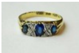
Lot: 40 EDWARDIAN STYLE DIAMOND AND SAPPHIRE DRESS RING set in eighteen carat gold and platinum, ring size P-Q Estimate: £150.00 - £170.00