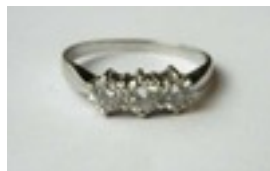
Lot: 43 DIAMOND THREE STONE RING the diamonds totalling approximately 0.65cts, on eighteen carat white gold shank, ring size L Estimate: £350.00 - £400.00