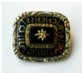
Lot: 24 VICTORIAN MOURNING BROOCH with seed pearl, agate and enamel decoration, the reverse inscribed 'The Revd. Wm. Fleming A.M. died the 18th Dec. 1845. Aged 69' Estimate: £40.00 - £50.00