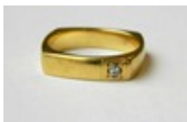
Lot: 39 DIAMOND SET UNMARKED GOLD DRESS RING ring size M- N Estimate: £60.00 - £80.00