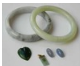
Lot: 69 COLLECTION OF JADE comprising two jade bangles, a jade pendant with nine carat gold mount and Chinese character mark decoration, and a heart shaped jade piece; plus two loose oval cabochon moonstones (6)