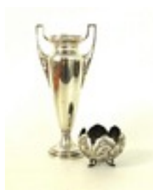
Lot: 137 INDIAN SILVER BOWL in the form of a Lotus flower, each of the petals with relief flower decoration, raised on three dolphin supports, 6cm high; and a WMF twin handled vase, the handles with feathered detail, 23.8cm high (2) Estimate: £30.00 - £50.00