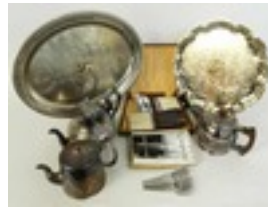
Lot: 154 QUANTITY OF SILVER PLATED WARES to include an oval tray, a circular salver with a shaped border, a cased set of six fish knives and forks, six cake forks, six boxed fruit knives, a Walker and Hall tea pot and another tea pot Estimate: £40.00 - £60.00