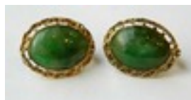
Lot: 42 PAIR OF JADE EARRINGS the oval jade stones in pierced unmarked gold mounts Estimate: £60.00 - £80.00