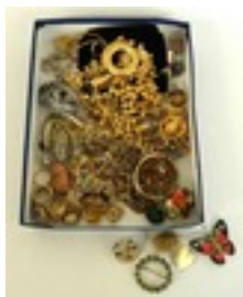
Lot: 37 ASSORTMENT OF COSTUME JEWELLERY including various gold effect necklaces, earrings, bracelets and a variety of different brooches, etc Estimate: £30.00 - £40.00