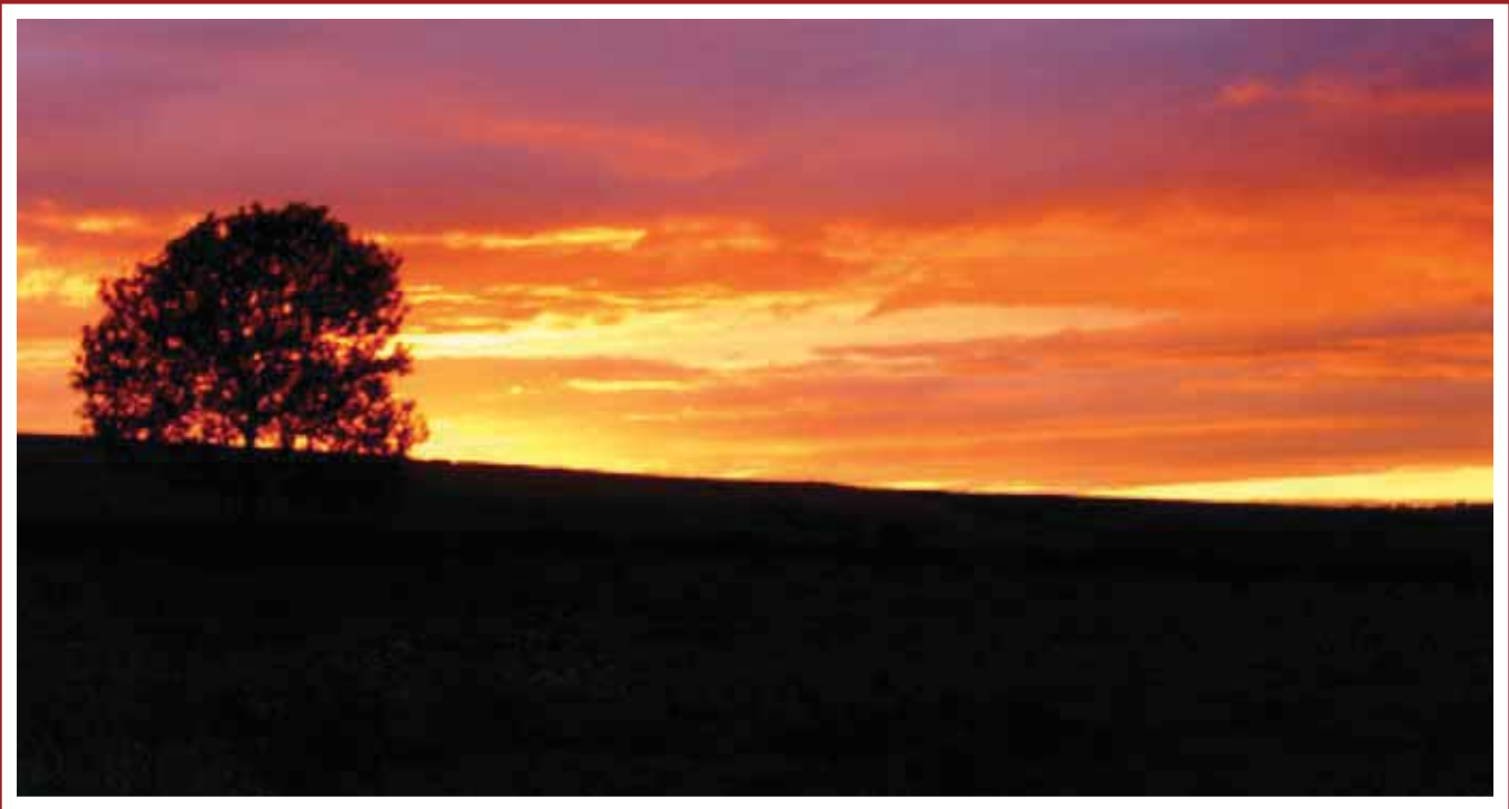
Sunset, Boulogne, France.