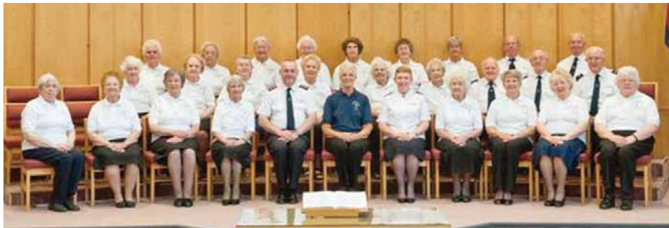
Members of Sale's Young In Heart Club Choir enjoy what they do, which includes weekly rehearsals and participating in the worship meetings