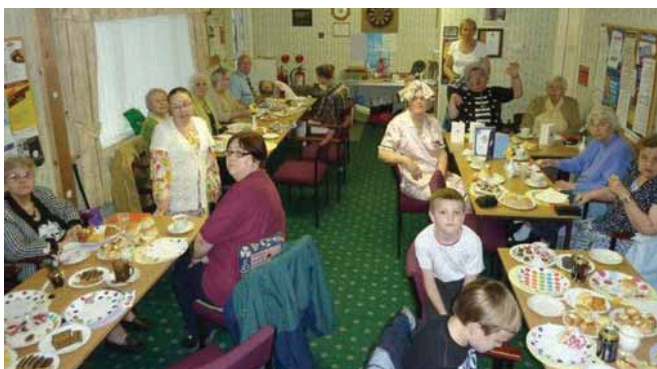
Corps members at Gateshead celebrate the third anniversary of their outreach ministry in Birtley with a fancy dress competition raising more than £100 for Bethany Children's Home, Haiti