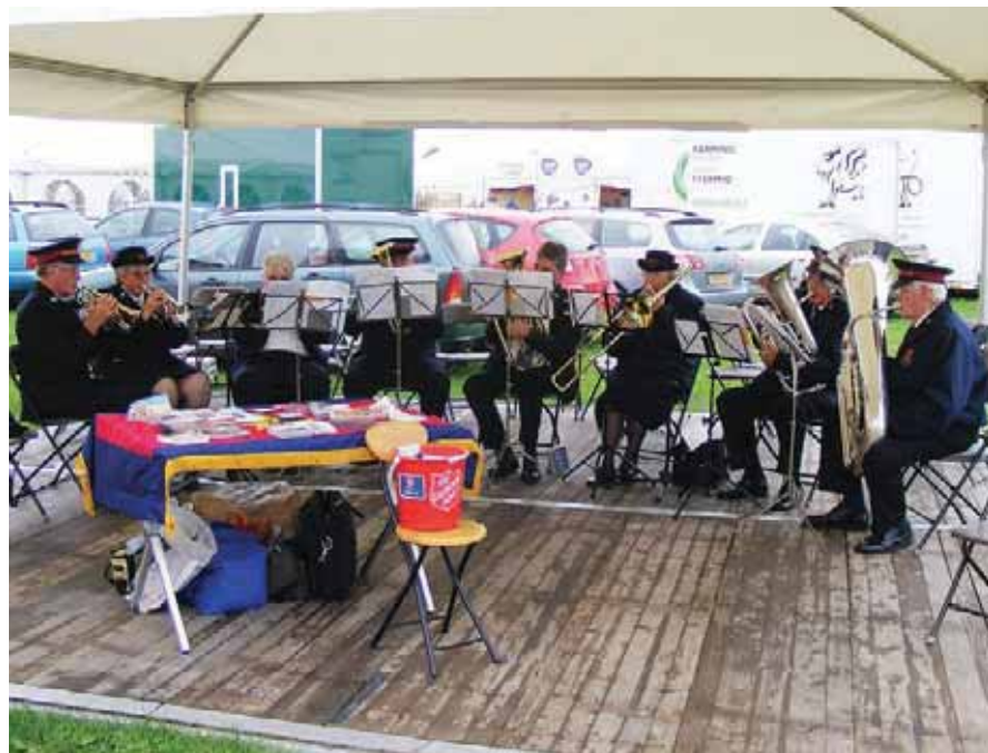
Tenby Band participates in the Pembrokeshire County Agricultural Show after an invitation recognising the 125th corps anniversary; corps members contacted many people, distributing leaflets and sticks of Tenby rock