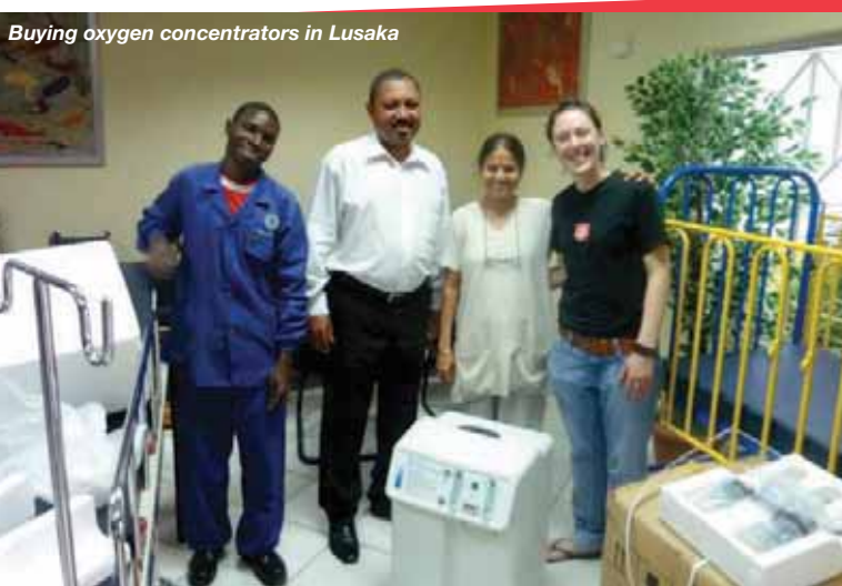
Buying oxygen concentrators in Lusaka

the ambulance. The Chikankata team regularly contended with these issues.