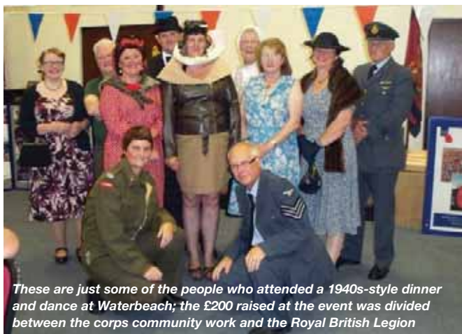
These are just some of the people who attended a 1940s-style dinner and dance at Waterbeach; the £200 raised at the event was divided between the corps community work and the Royal British Legion