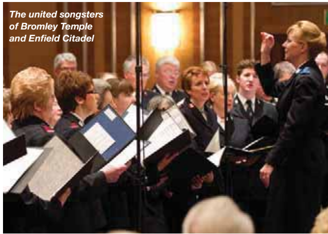
The united songsters of Bromley Temple and Enfield Citadel

when you are in trouble it is terrific. We have experienced the Army at its best during our difficult times.