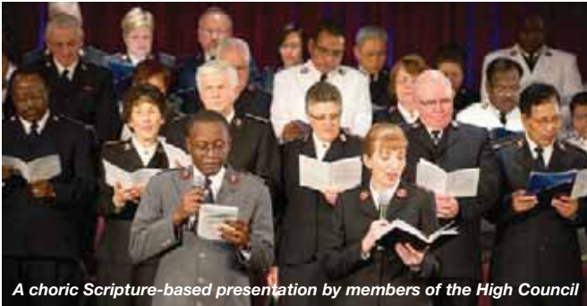
A choric Scripture-based presentation by members of the High Council