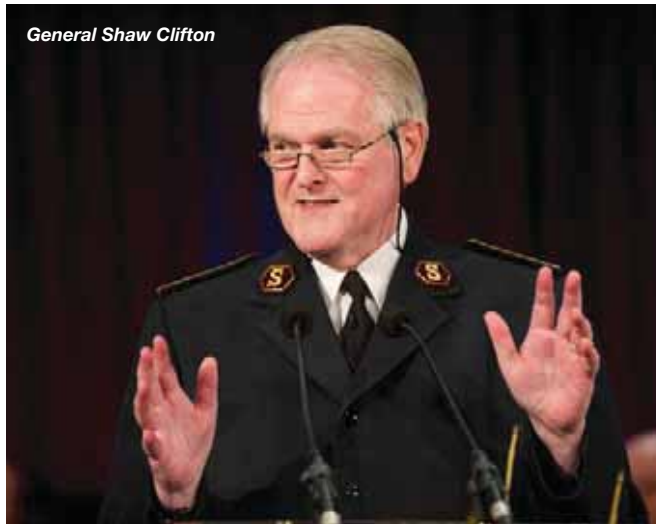
General Shaw Clifton

Later in the meeting, during General Clifton's Charge to the