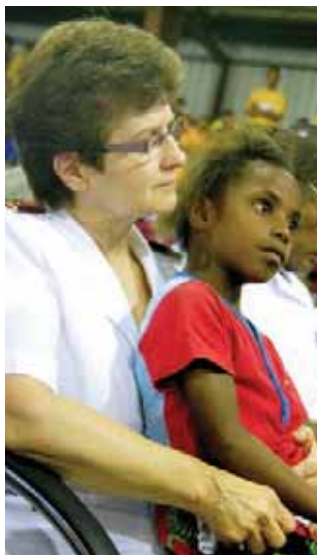
The General enjoys the youth rally with a young friend