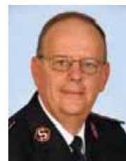
COMMISSIONER ANDRÉ COX

No matter what we have to face in 2013, we can look forward to the fact that God is in control of our lives and he knows what he is doing.