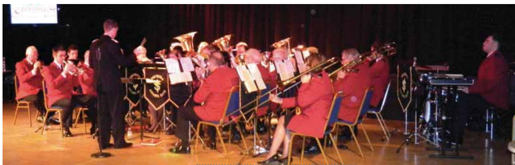
Southsea Band plays carols to a packed ballroom at Mill Rythe Holiday Park

The craft group held a coffee morning and craft fair in the hall, raising £395. This was quickly followed by the toy service which included the annual talent scheme altar service, raising £900. The ladies fellowship carol service for the Northumberland Air Ambulance raised £100. – P. H.