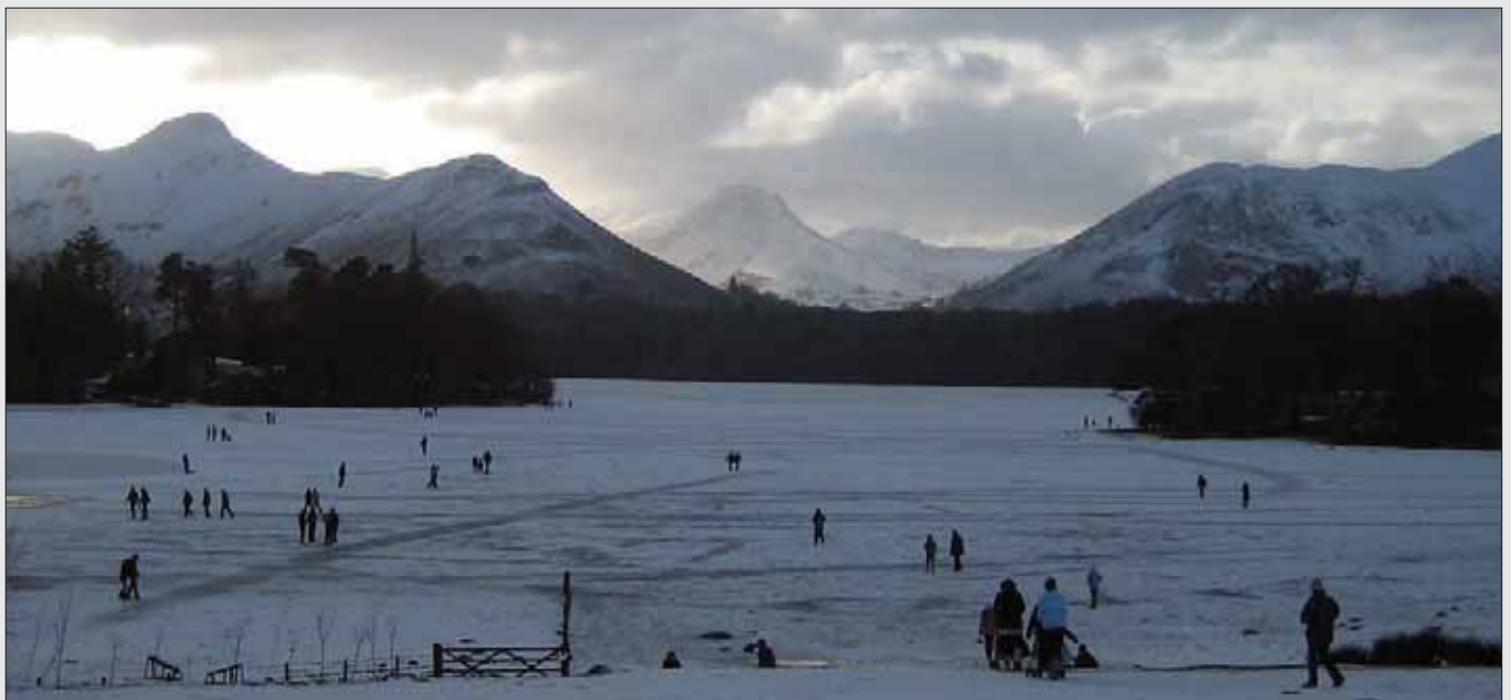
Derwent water, Cumbria.