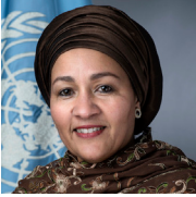
Amina Mohammed United Nations Deputy Secretary-General