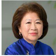
Mari Pangestu World Bank Managing Director Development Policy and Partnerships