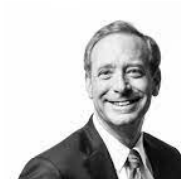
Brad Smith Vice Chair and President, Microsoft

Trillions in investments are needed to deliver on the SDGs by 2030