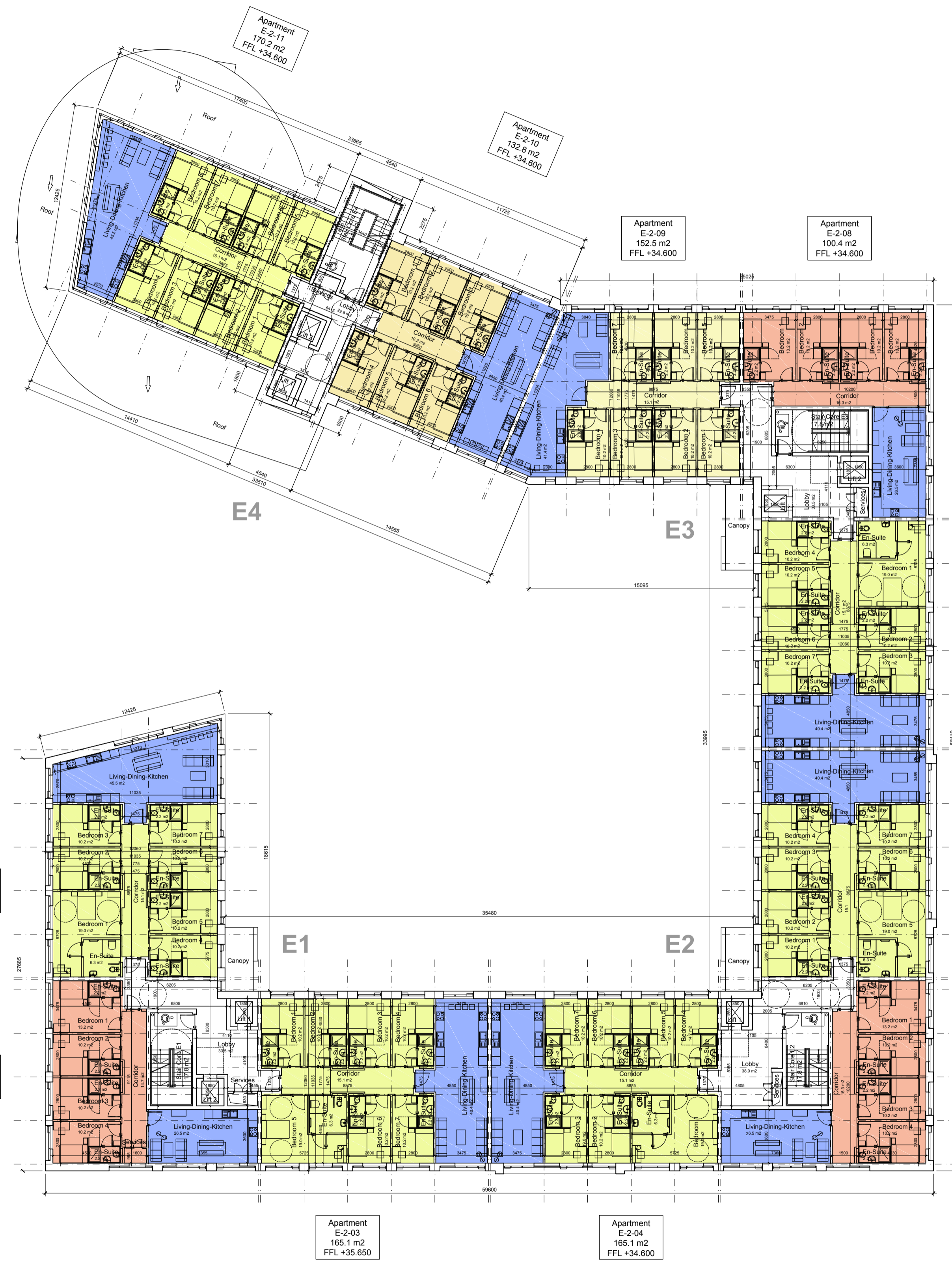
BLOCK E - APARTMENTS SECOND FLOOR PLAN SCALE 1:200