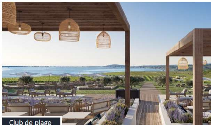
Club de plage