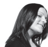
Rachel Thomas Interior Design, Urban Splash