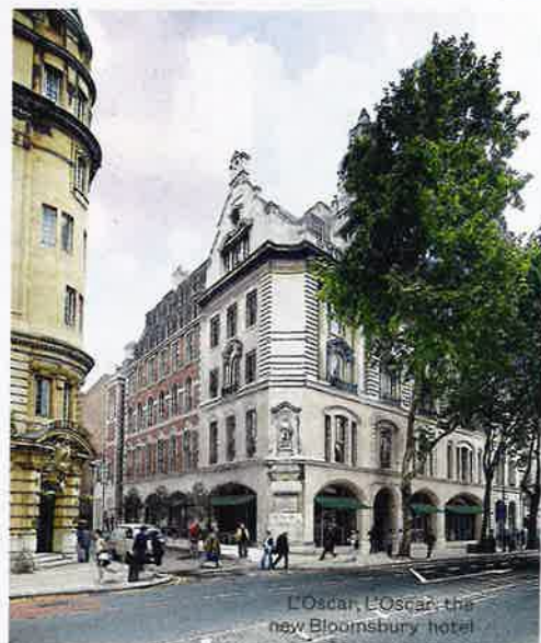
L'Oscar, L'Oscar: the new Bloomsbury hotel

Bloomsbury has always been a bit of a weird one — not much there besides Noble Rot and the ghosts of wife-swapping, suicidal Edwardian feminists. But WCI is kicking off: two well cool hotels (The Principal, with Dalston party restaurant Neptune; the swanky L'Oscar), chic women's club The AllBright, brilliant Fortitude Bakehouse in a garage and most importantly, a second branch of Roti King.