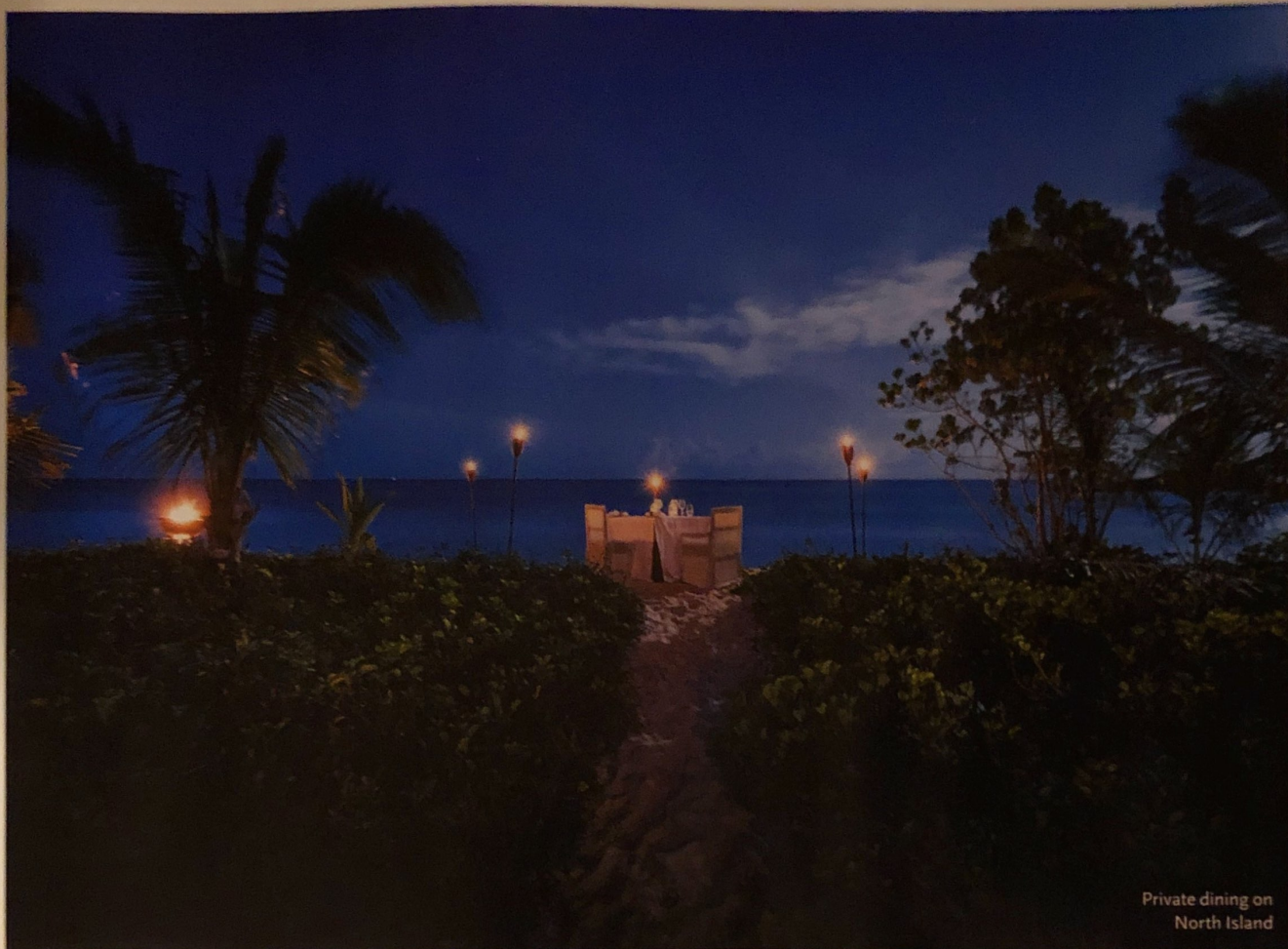
Private dining on North Island