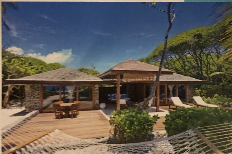
C CLOCKWISE FROM TOP LEFT: Sushi on North Island; a sea turtle in French Polynesia; a two-bedroom villa on Petit St. Vincent.

deep-sea fishing, or a sunset cruise. North Island's chef can customize a meal fit for royals to be delivered to a rugged bluff overlooking the ocean, a spot known for its magical sunsets. north-island.com .