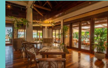
STARS RESTAURANT – FINE DINING