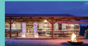
RUM SHED BAR & GRILL