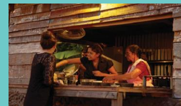
LA KAZE MAMA – AUTHENTIC CUISINE