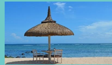
STARS ON THE BEACH – FEET IN THE SAND