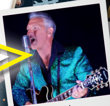
Soul & Motown