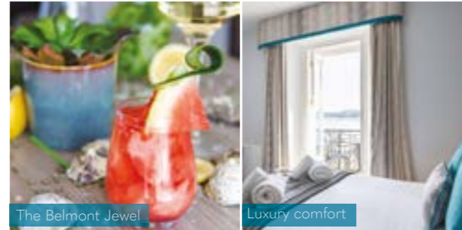
The Belmont Jewel