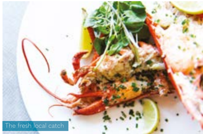
The fresh local catch