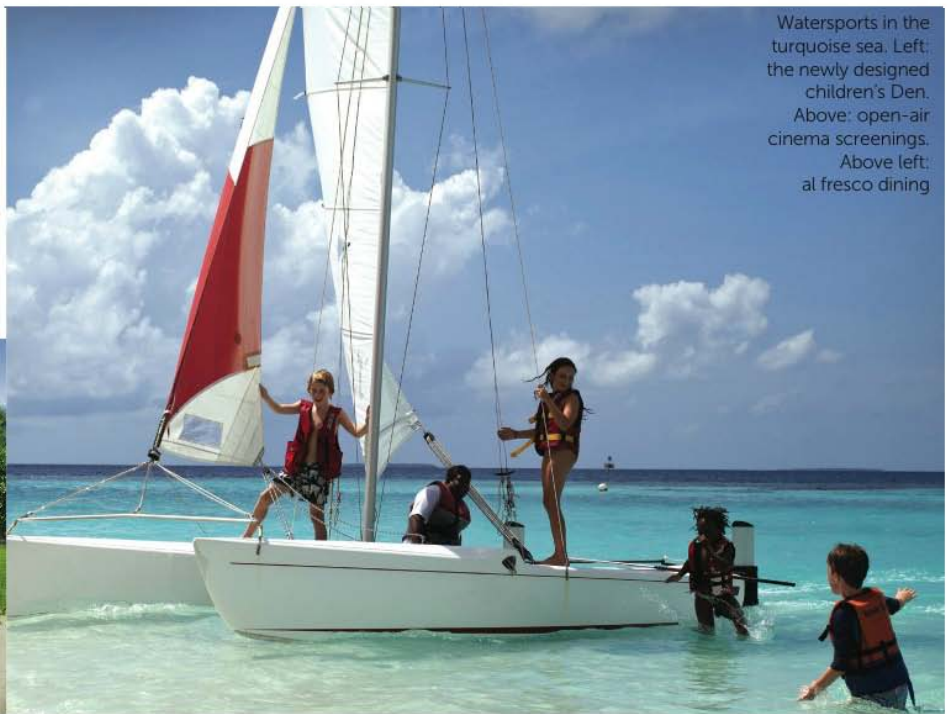
Watersports in the turquoise sea. Left: the newly designed children's Den. Above: open-air cinema screenings. Above left: al fresco dining