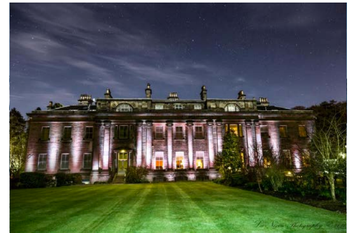
Lee's Wedding Photography