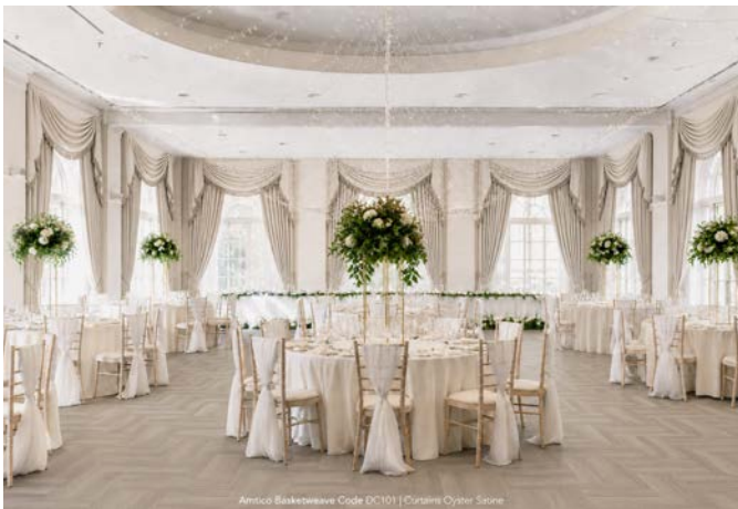
Antico Basketweave Code DC101 | Cursons Oyster Saloon