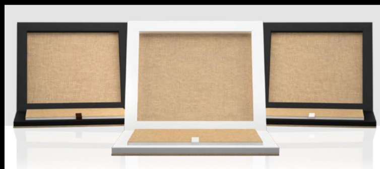
Book & Box