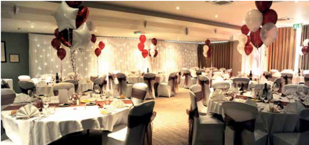
Images clockwise from top left Private dining room; glass roofed Atrium; grounds with Duxford Chapel; Garden Room.