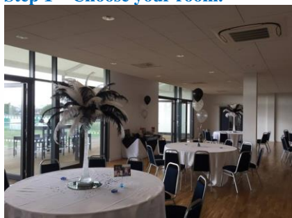
The Main Room & Balcony - £750.00