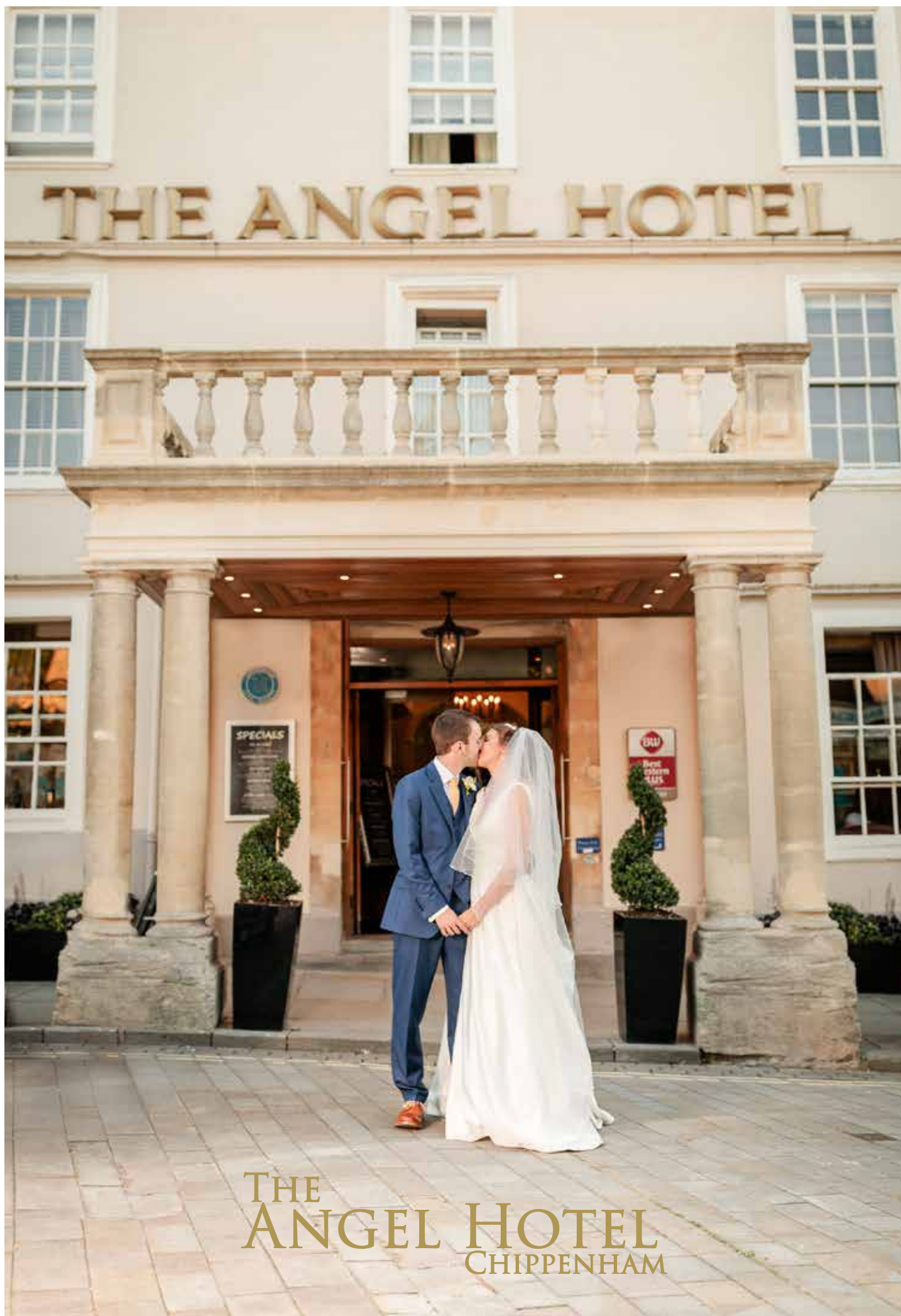
THE ANGEL HOTEL CHIPPENHAM