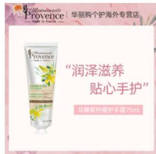
161,00 ¥ Miss Provence Verveine Citron Crème Mains