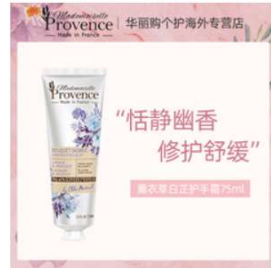
161,00 ¥ Miss Provence Crème Mains Lavande Angelica 75 ml Fraîche et Élégante Nourrit