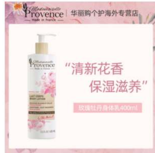
316,00 ¥ Miss Provence Rose Peony Body Lotion Body Lotion 400ml Hydratant Hydratant