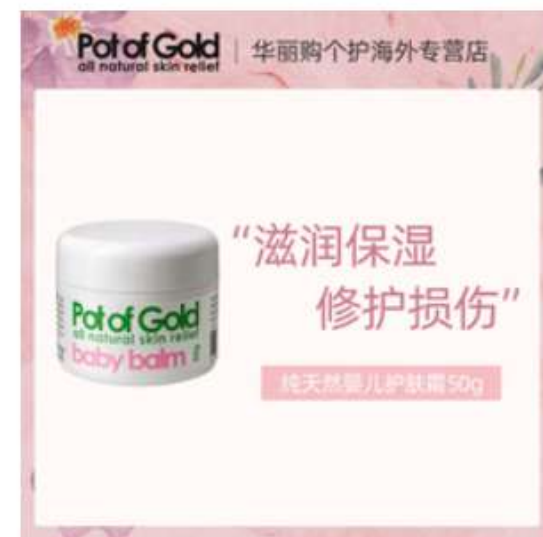
196,00 ¥ Pot of Gold Pure Natural Apaisante Peau