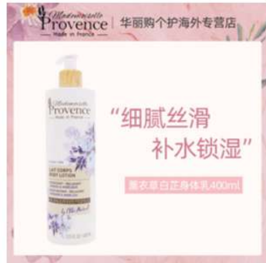
316,00 ¥ Miss Provence Lavender Angelica Body Lotion 400ml Décompression Lotion