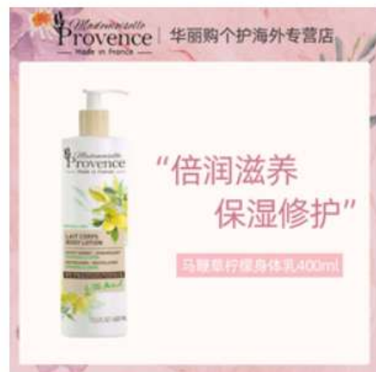
316,00 ¥ Miss Provence Lotion Corporelle Hydratante