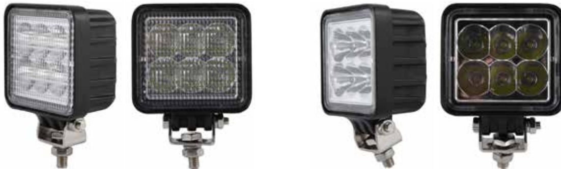
LAM2375 6 LEDs, 1260lm Flood beam