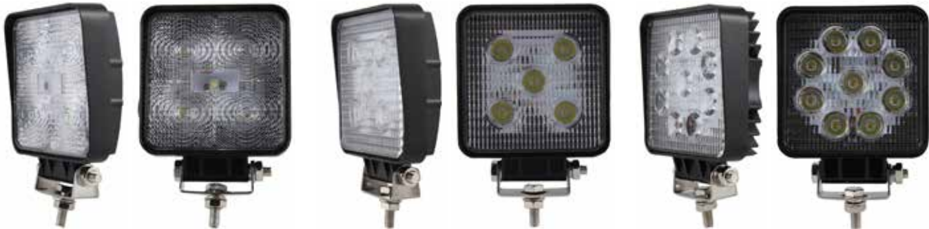
LAM2372 5 LEDs, 1050lm Flood beam