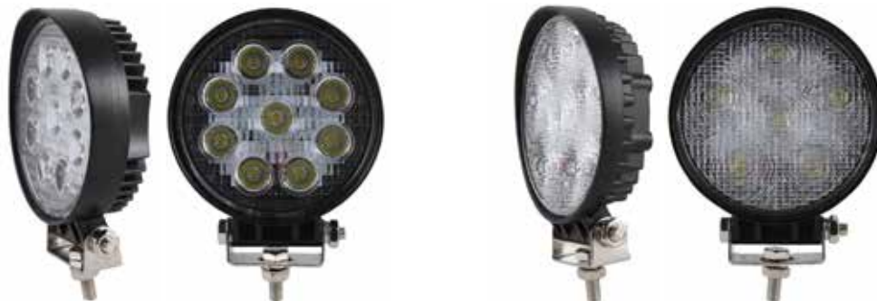
LAM2370 9 LEDs, 1890lm Flood beam