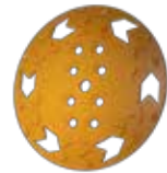
E12020 PCD GRINDING DISC Ø250 MM