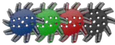
BG707116 BG707117 BG707118 BG707114 STAR GRINDING DISC Ø250 MM