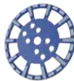
BG707115 BLUE PREMIUM DISC Ø250 MM