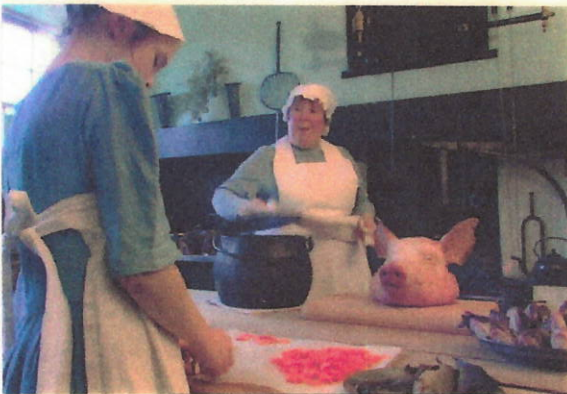
Cook and kitchenmaid preparing dinner in the kitchen (still from Georgian House film)

The main focus of the basement was of course the kitchen. A steady stream of servants would be seen busily dashing to and from the upstairs rooms carrying dishes of food, coals for the many fires, water for washing and tea-making, bottles of wine for the gentlemen, not to mention the chamber pot from the bedrooms and dining room!