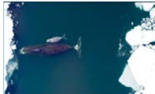
Bowhead whale mother and calf in the Arctic. (US NMFS Permit No. 14245).