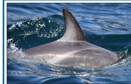
Close-up of dusky dolphin flank and dorsal fin showing distinctive blaze and markings.

IUCN Conservation status: data deficient