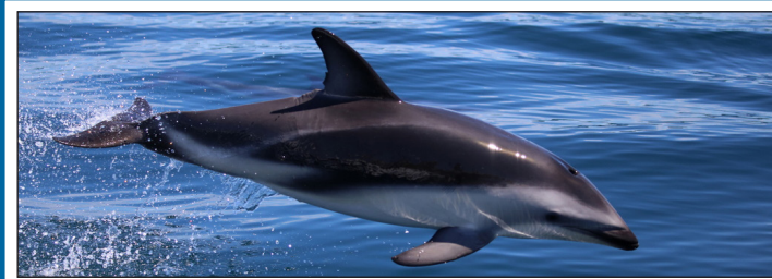
Dusky dolphin in South Africa