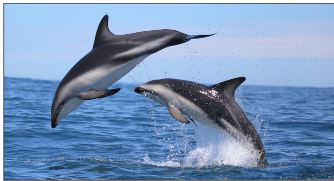
Dusky dolphins in South Africa