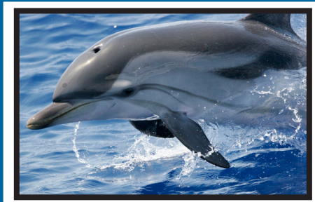
Striped Dolphin.

Threats: Bycatch Habitat: continental shelf, offshore Diet: small schooling fish, squid IUCN Conservation status: Least concern Mediterranean subpopulation: Vulnerable