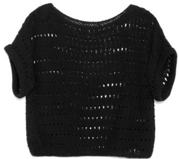
The Diana Sweater, $179