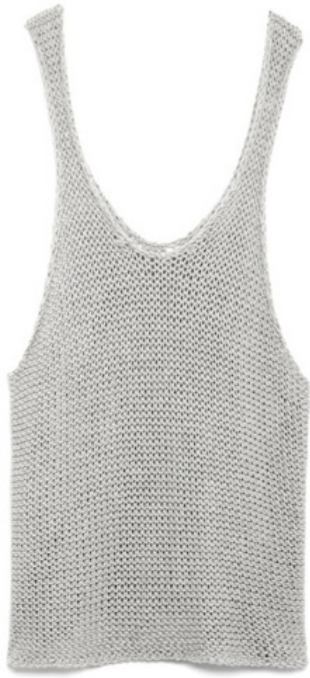
Tala Tank, $100

http://ecosalon.com/diy-spring-sweaters-with-wool-and-the-gang/