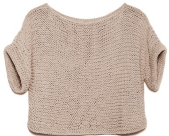
Mary Sweater, $179