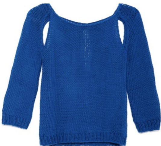
Sexy Back Sweater, $189