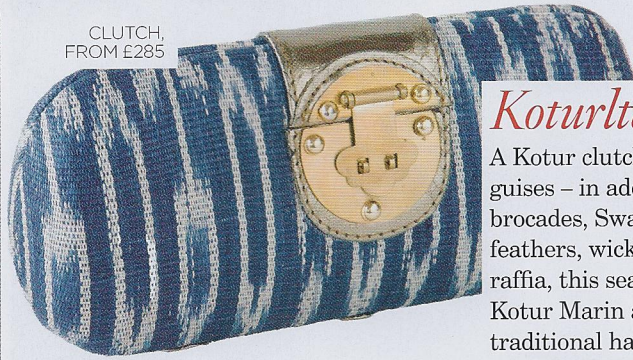
CLUTCH, FROM £285