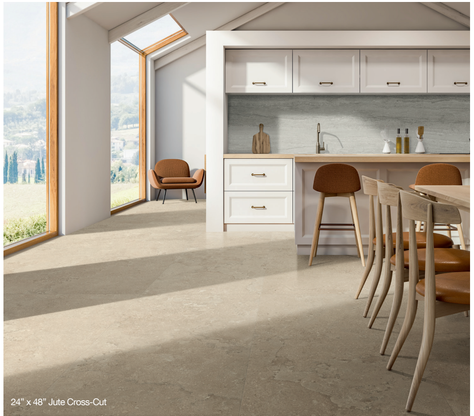
24" x 48" Jute Cross-Cut