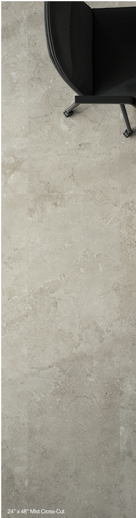
24" x 48" Mist Cross-Cut