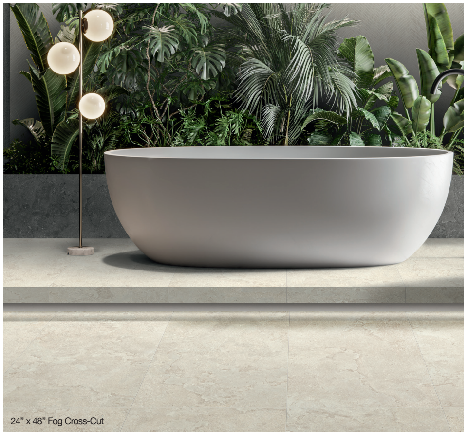
24" x 48" Fog Cross-Cut