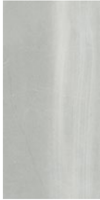
Light | V3

24x48 NAT RECT | #79884ET 12x24 NAT BOLD | #79879ET