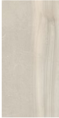
Seedpearl | V3

24x48 NAT RECT | #79886ET 12x24 NAT BOLD | #79881ET