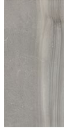
Chateau Gray | V3

24x48 NAT RECT | #79887ET 12x24 NAT BOLD | #79882ET