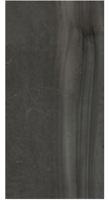
Dark | V3

24x48 NAT RECT | #79883ET 12x24 NAT BOLD | #79878ET