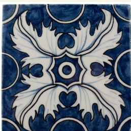
Monte Real 6X6