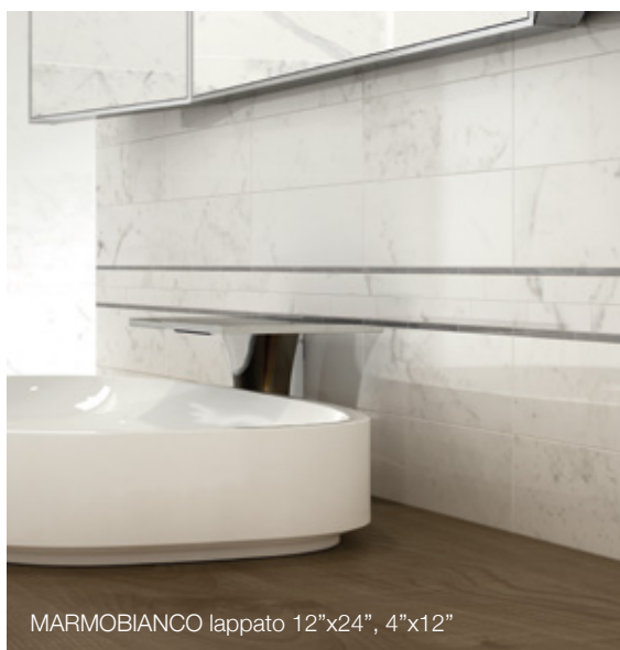
MARMOBIANCO lappato 12"x24", 4"x12"