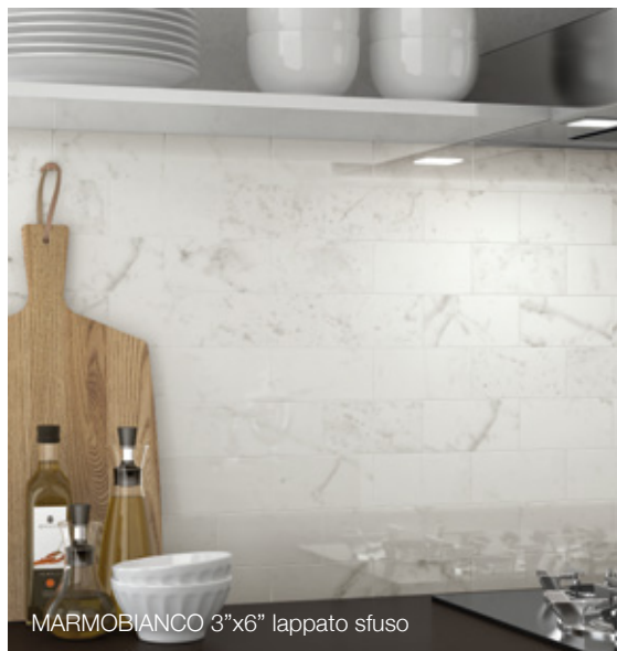
MARMOBIANCO 3"x6" lappato sfuso