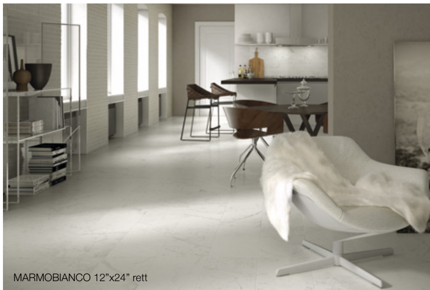
MARMOBIANCO 12"x24" rett