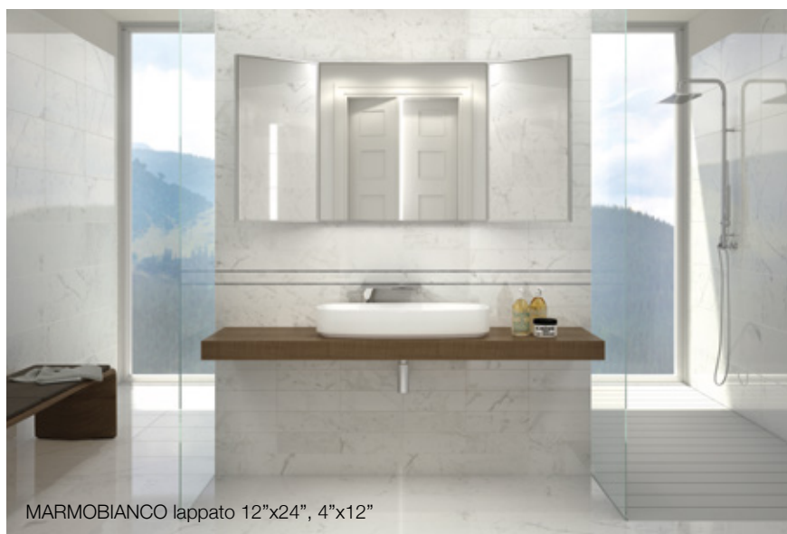
MARMOBIANCO lappato 12"x24", 4"x12"